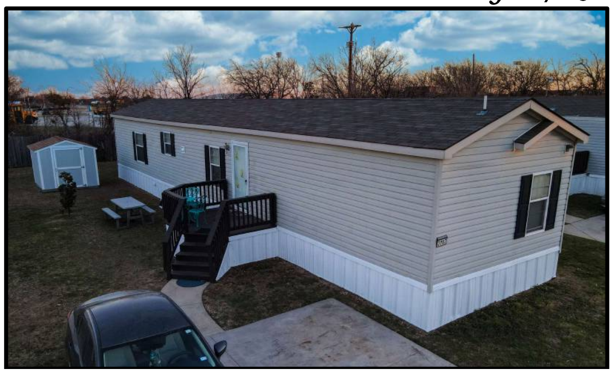
Reasons that you'll regret if you let this house pass...